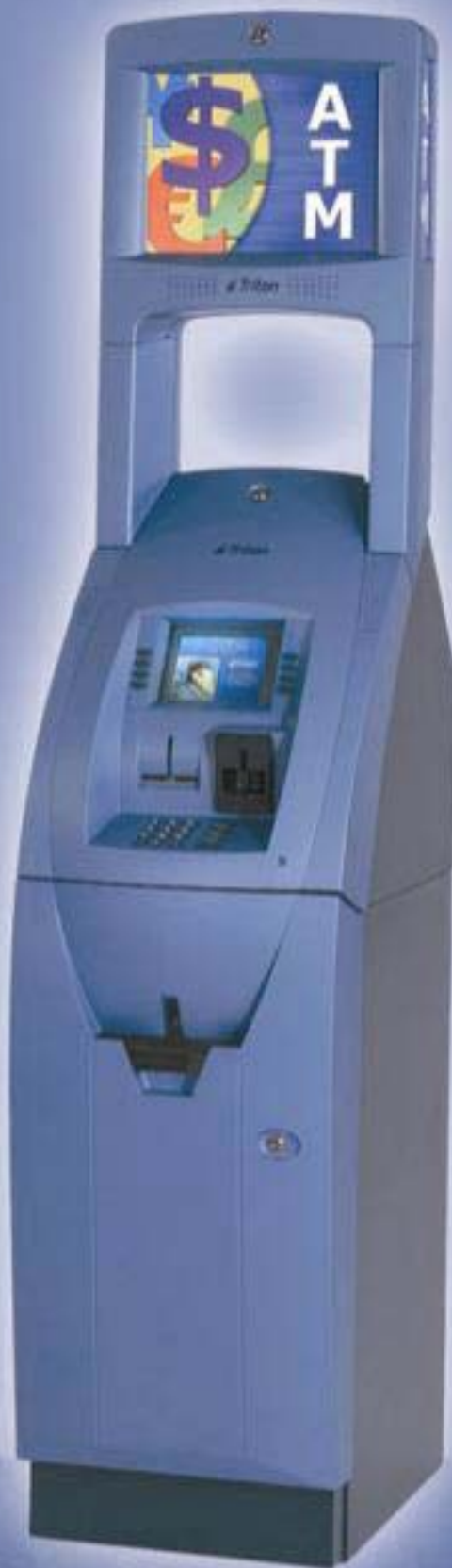
9700 with backlit high topper

Triton's 9700 Series ATMs are the perfect low-cost solution for today's retail ATM market. These sleek, new machines offer legendary Triton reliability and a host of standard features that are upgrades on other ATMs—all at an unbeatable price. That's what makes the 9700 the new workhorse of the industry.