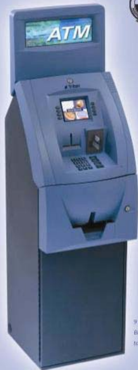
9100 with Backlit topper